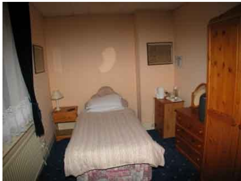
A look into the single room

On our first floor we have four accommodation bedrooms From the stairs going left we have our only single room