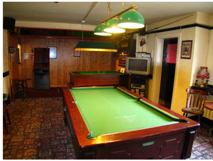
The pool room also has a bar billiards table Television and a dart board