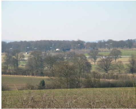
A view of St Georges Park from the New Inn