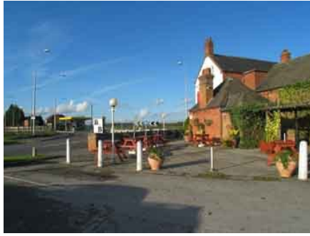
A view of the New Inn from the car