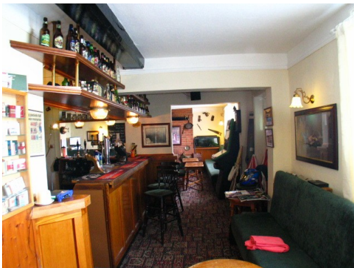
Looking back from the snug bar