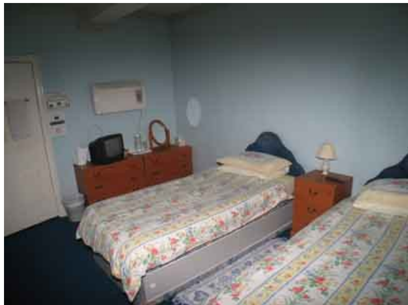
The second twin room