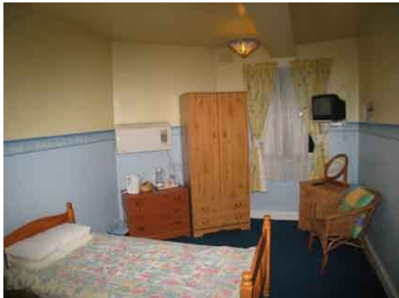
The first of our twin rooms

Turn right from the stairs and enter the passage to our other three bedrooms