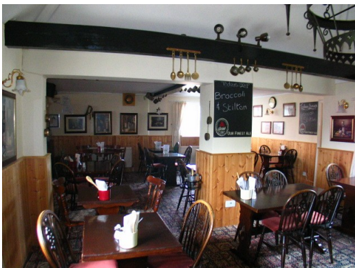
Around the restaurant