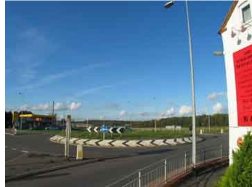
The new island