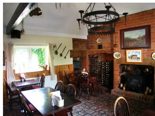
Around the restaurant