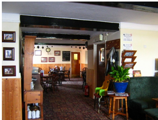
Bar looking towards the restaurant