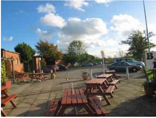
A view of the car park from the patio