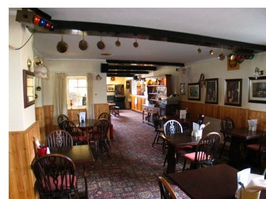
Looking back towards the bar