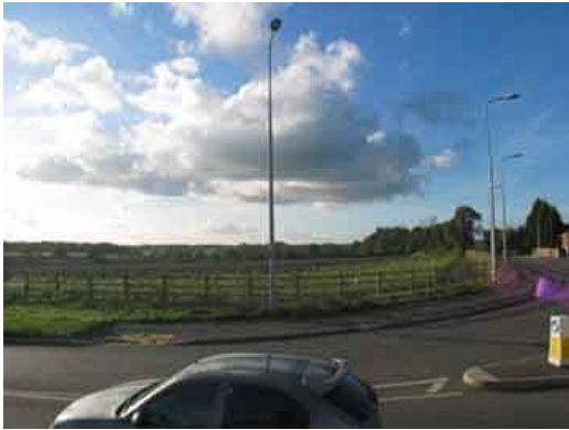
The countryside around us