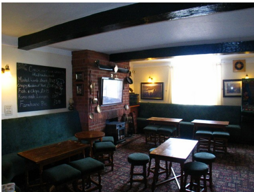
From reception a look into the bar