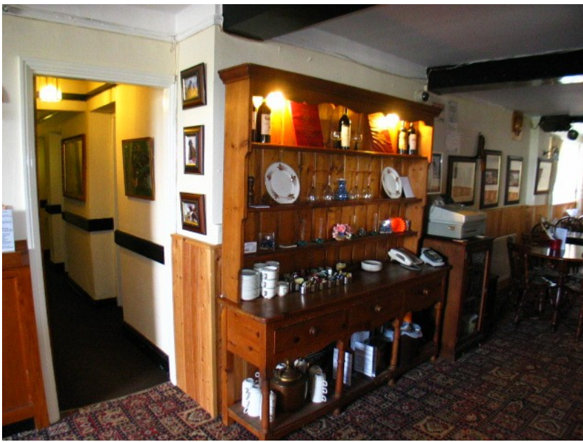
Our old Welsh dresser & the corridor to the pool room