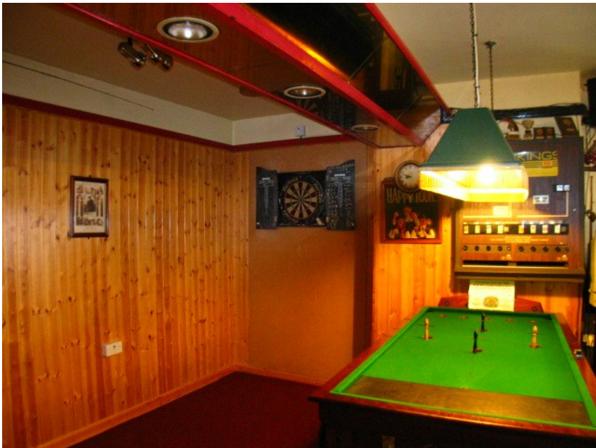
The dart board and billiards table