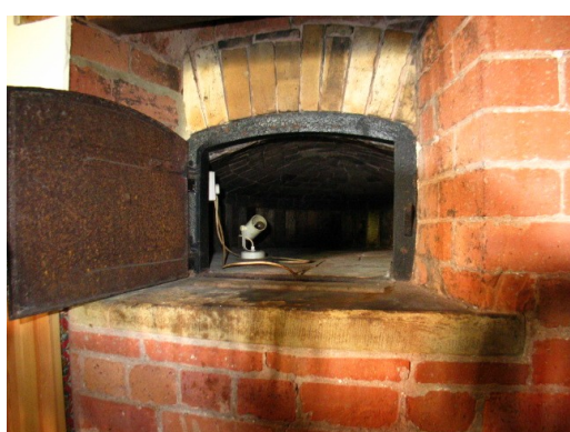
Our old bread oven in the restaurant