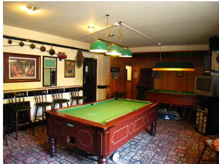
A view back to the corridor