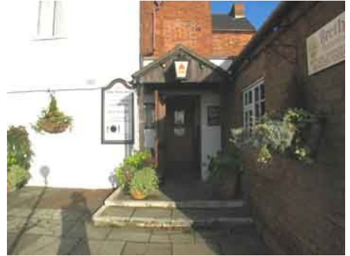
Entering the New Inn