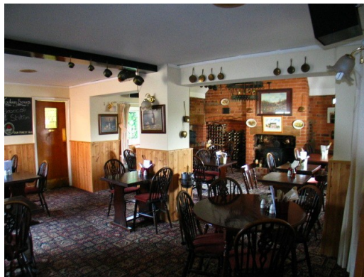
From reception a look into the restaurant